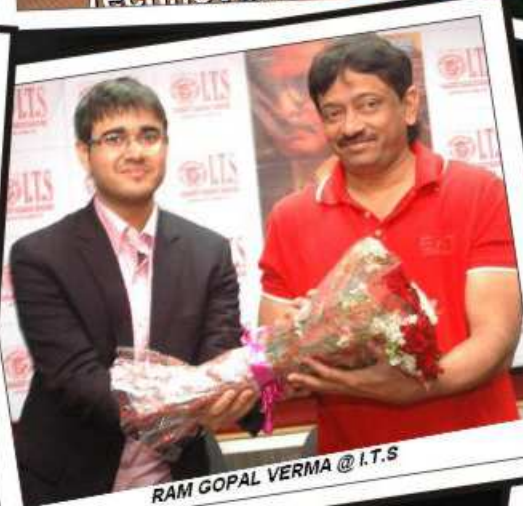
RAM GOPAL VERMA @ I.T.S