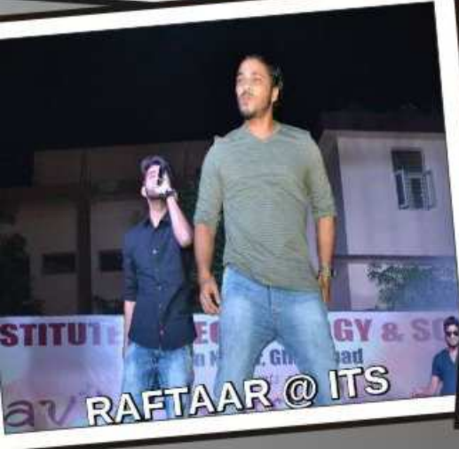
RAFTAAR @ ITS