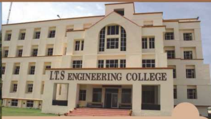
I.T.S- Engineering College, Greater Noida (Estd : 2006)

B.Sc. (Biotech), M.Sc. (Biotech) Affiliated to Ch Charan Singh University, Meerut