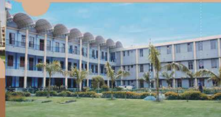
I.T.S. - Dental College, Greater Noida (Estd : 2006)

M.Tech. (CSE) B.Tech. (EC, EE, ME, CS & Civil)