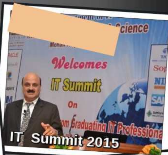
IT Summit 2015