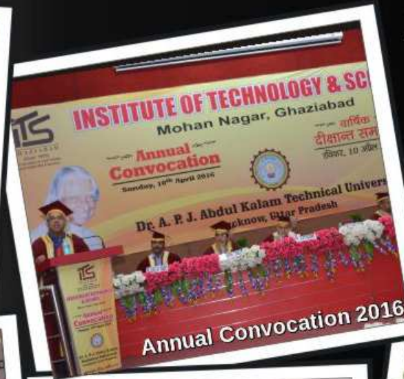
Annual Convocation 2016