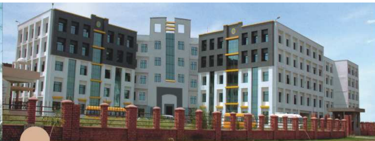
I.T.S- Dental College Murad Nagar (Estd : 2000)

BDS & MDS Affiliated to Ch. Charan Singh University, Meerut