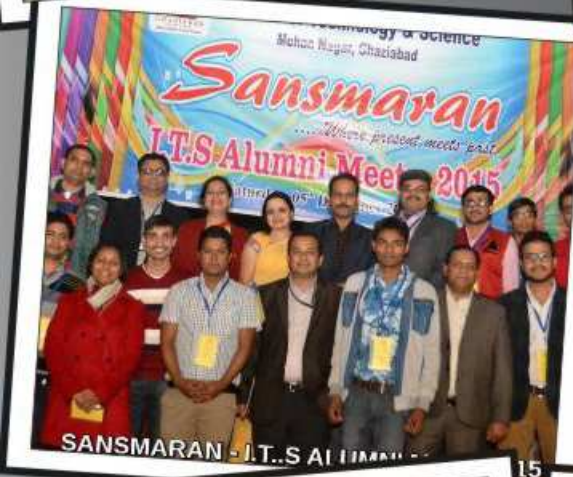
SANSMARAN - I.T.S ALUMNI MEET 2015