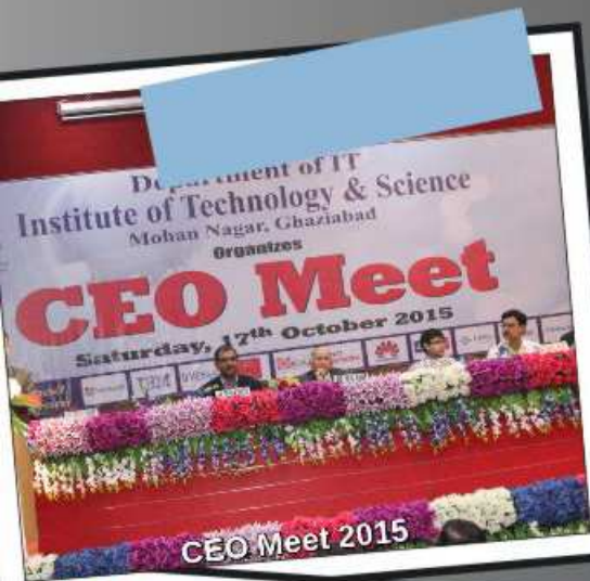
CEO Meet 2015