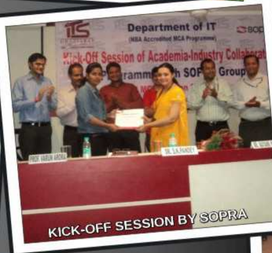
KICK-OFF SESSION BY SOPRA