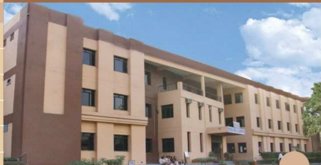
I.T.S- U.G. Campus, Ghaziabad (Estd. : 1995)