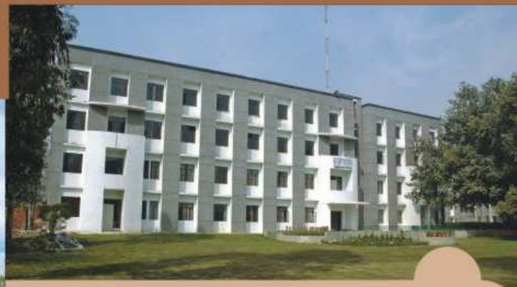
I.T.S- Paramedical College Murad Nagar (Estd : 1995)

B.Sc. (Biotech), M.Sc. (Biotech) Affiliated to Ch Charan Singh University, Meerut