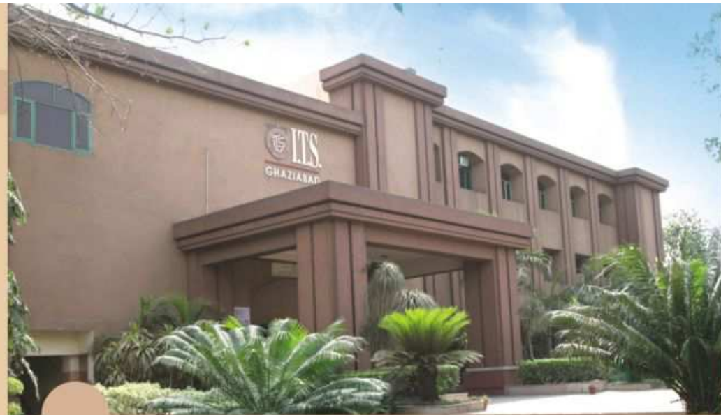
Institute of Technology & Science Ghaziabad (Estd : 1995)