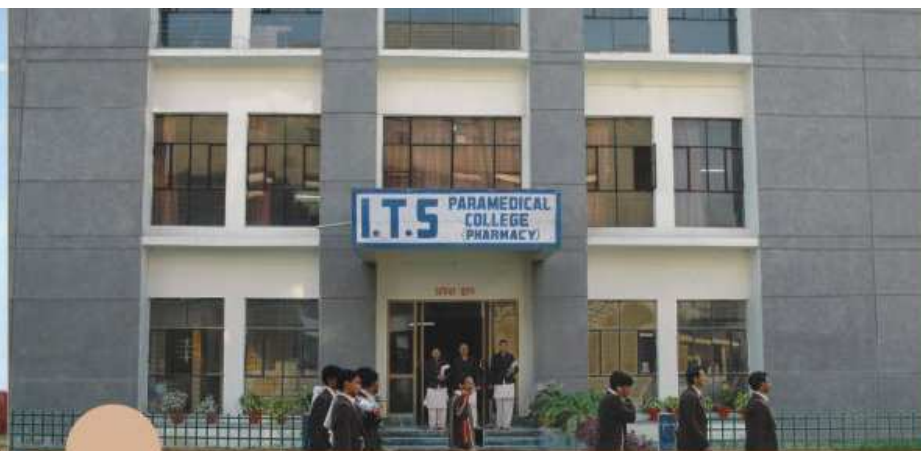
I.T.S- Pharmacy College, Murad Nagar (Estd : 2003)

BDS & MDS Affiliated to Ch. Charan Singh University, Meerut