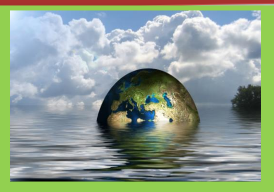
Impacts of Climatic Changes

Student Participation in External Events..Page 20