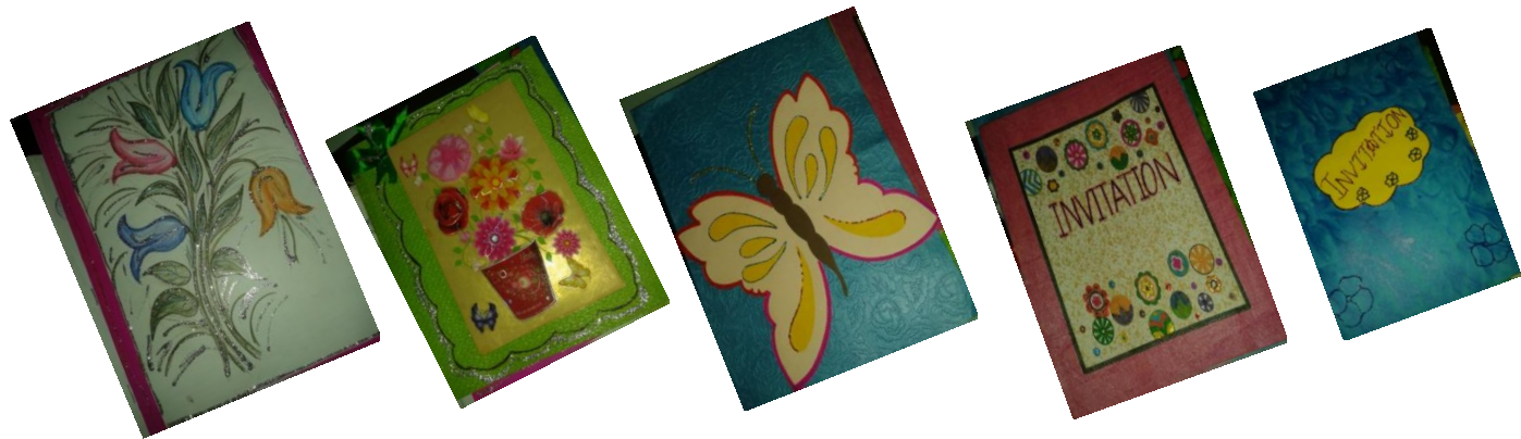
Some Glimpses of Festa d' addio.....