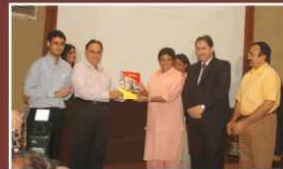
Dr. Kiran Bedi @ I.T.S

Absolute pleasure to be here. Loved the time spent here. Really good facilities and atmosphere.