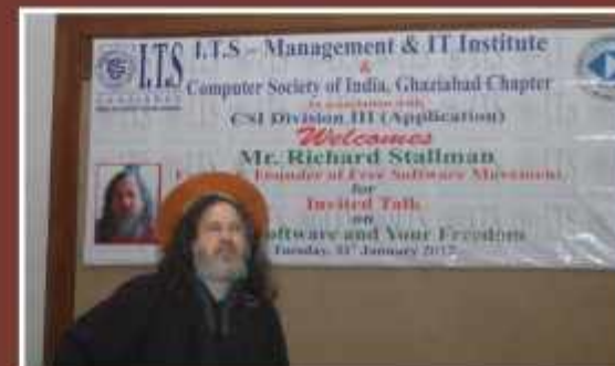
Mr. Richard Mathew Stallman @ I.T.S